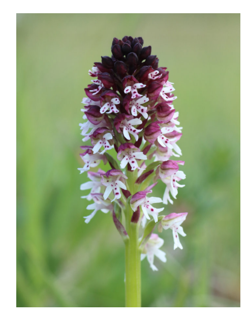
burnt-tip orchid ~ an endangered species ~

Should our children only learn about these rare plants from biology books?