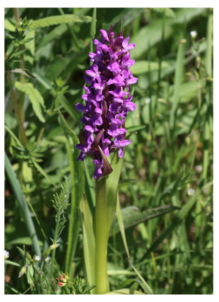
early marsh-orchid ~ an endangered species ~

As long as the above-mentioned rules are respected, there is are no restrictions on visiting a publicly accessible nature conservation area. However, if the areas do not have "marked paths". Please don't enter these areas!