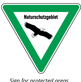
Sign for protected areas

A nature reserve (german: "Naturschutzgebiet" / abbreviation: NSG) is a specially protected area. Very strict regulations apply in these areas, as nature should remain as undisturbed as possible. Thus, no plants may be taken and no habitats may be destroyed or altered. According to this, all actions that lead to a lasting disturbance are also prohibited.